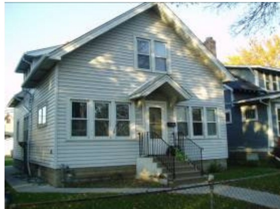
Kari lives in an upper level apartment in a home she shares with two other women.